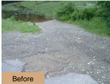
Private Boat Launch, Old Stage Road, Woolwich