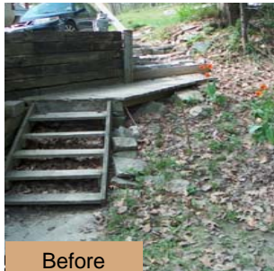
Private Property, Sabattus Pond, Sabattus